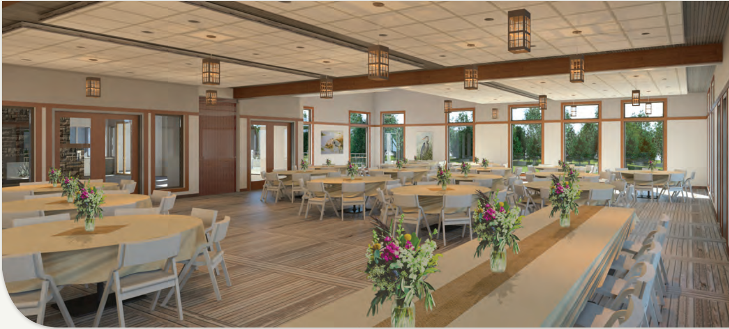
Rendering of Great Blue Heron Hall. With seating for 250, the space boasts flexible accommodations with expansive views of Turtle Pond, Sedge Meadow, and South Prairie.