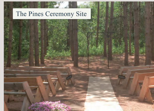
The Pines Ceremony Site